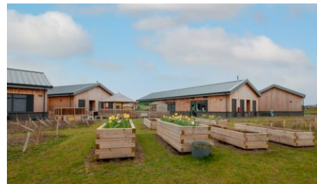
Early Years Pavilion

We also support children in four specific areas, through which the above areas are strengthened and applied. The specific areas are: