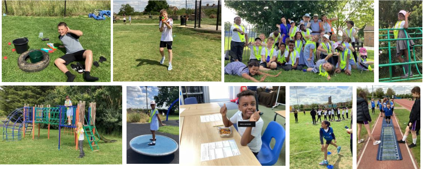
Bedford Borough Council Agreed School Term and Holiday Dates 2024/2025