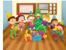
Christmas Parties 15th December