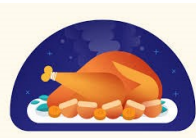
Christmas Dinner 6th December