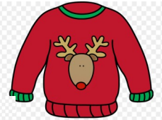
Christmas Jumper Day 6th December