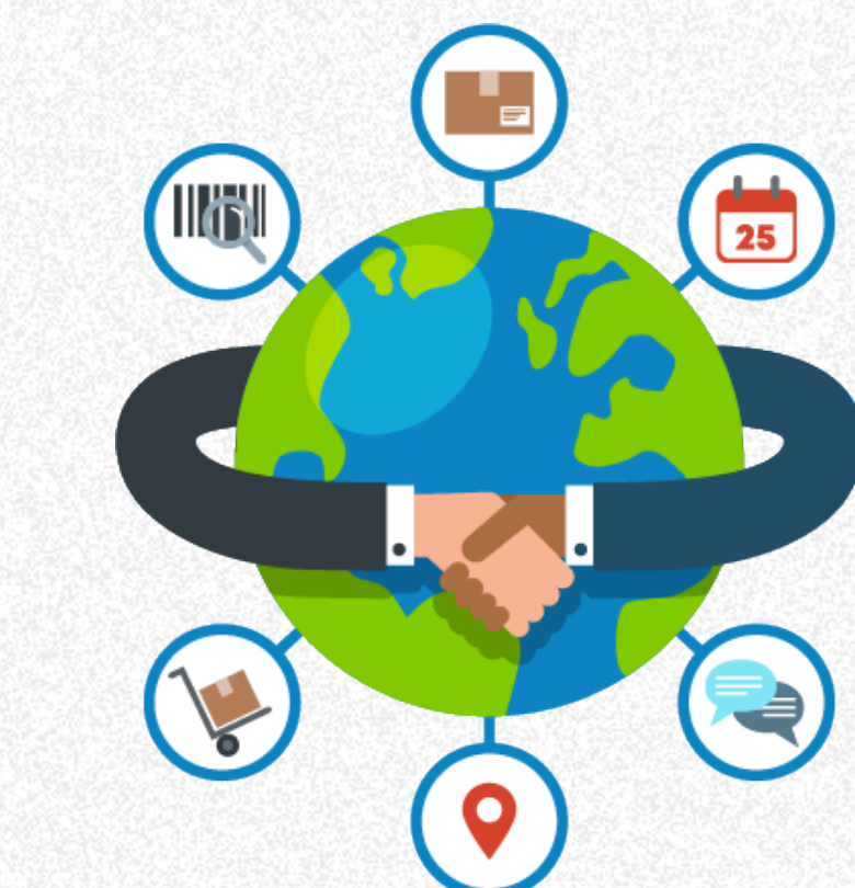
where the UK trades