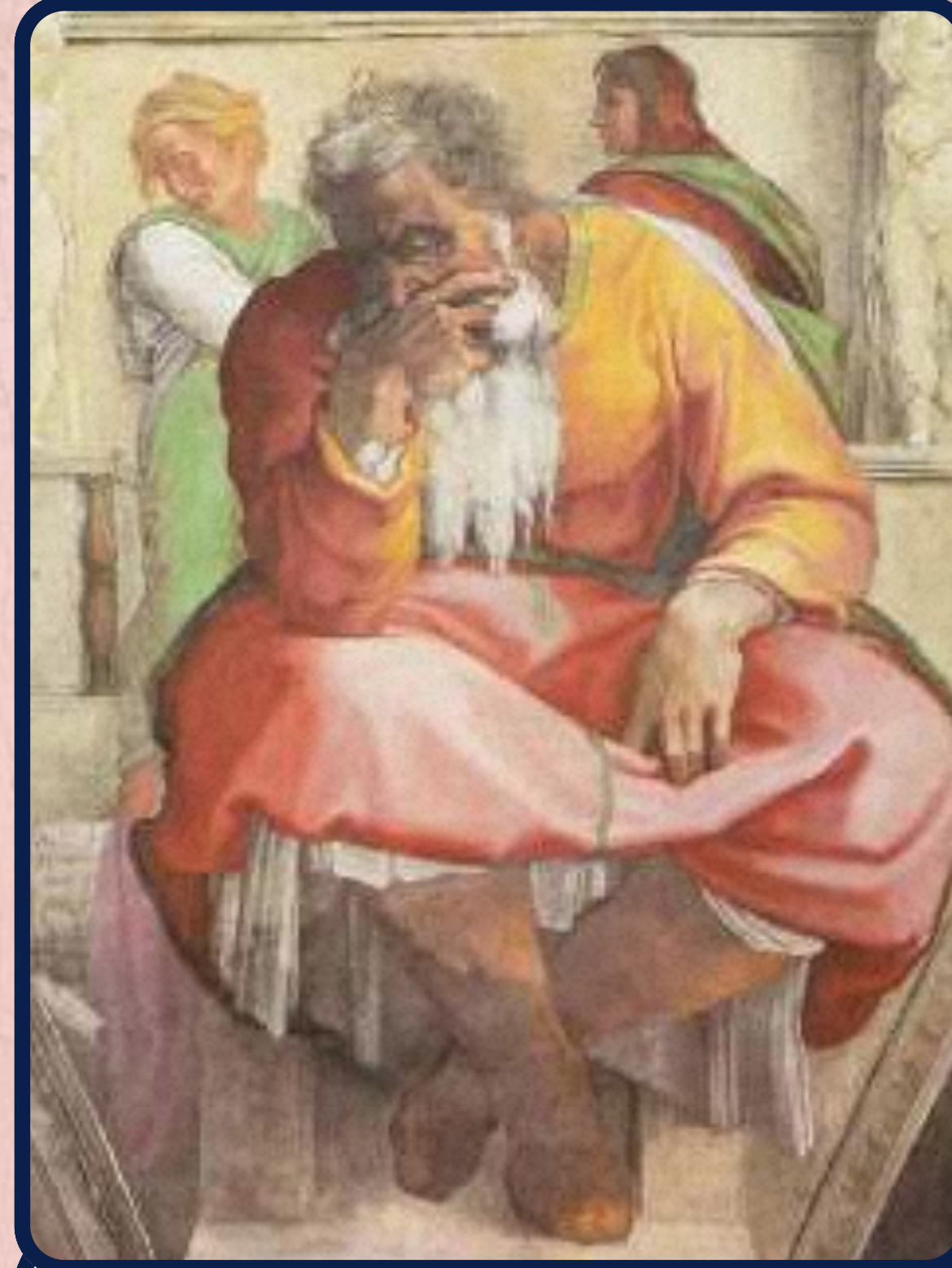
The Prophet Jeremiah, Sistine Chapel (1511)