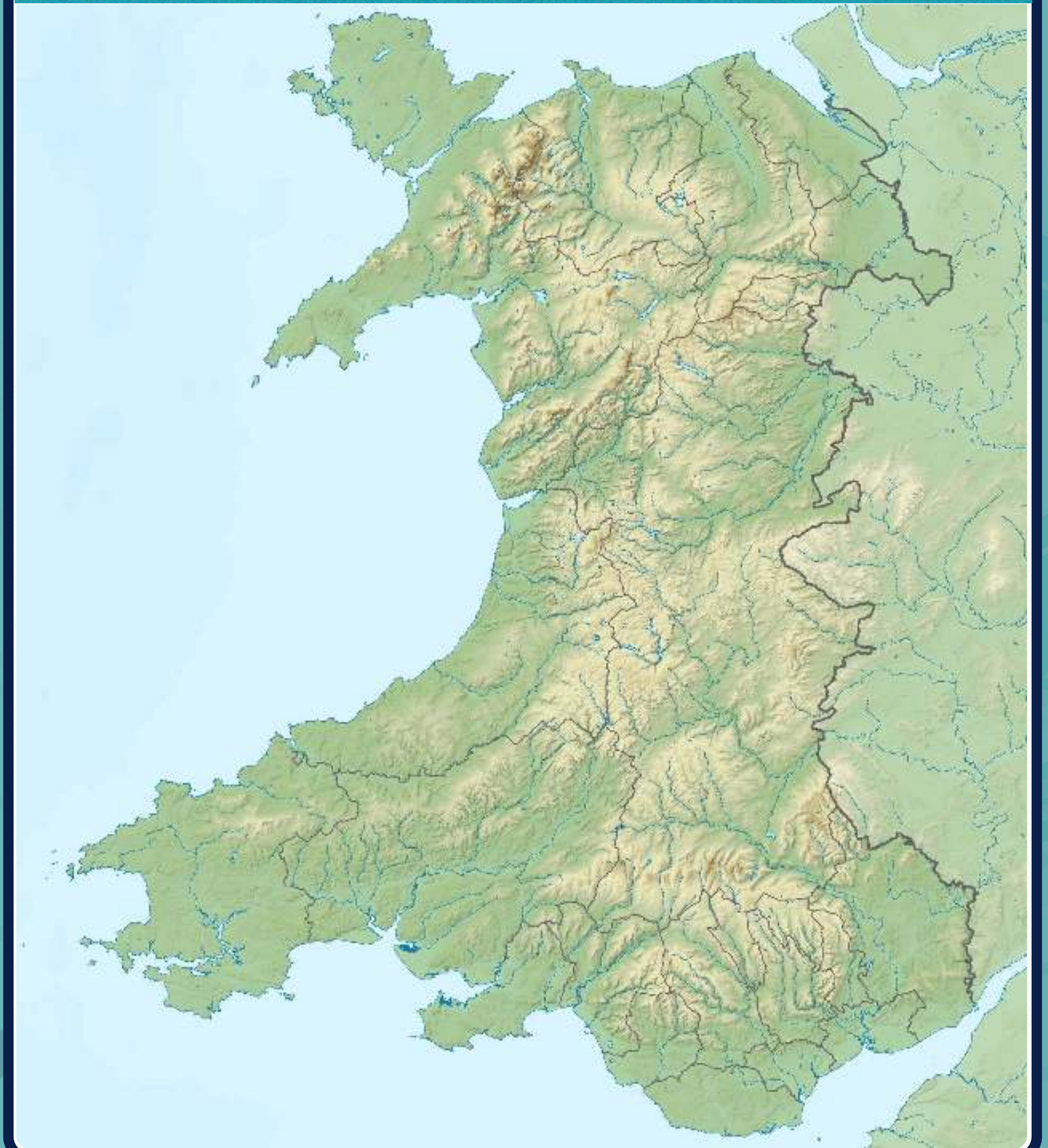
relief map of Wales

a map that uses shading and colours to indicate the height of the land