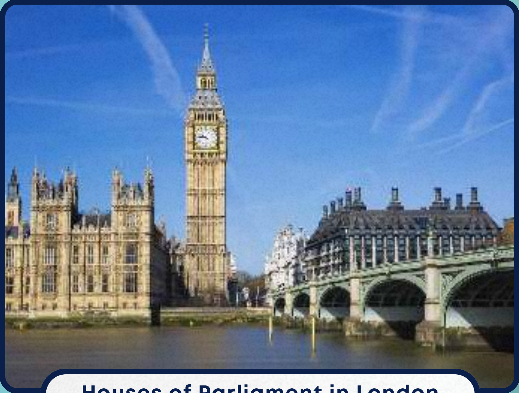
Houses of Parliament in London