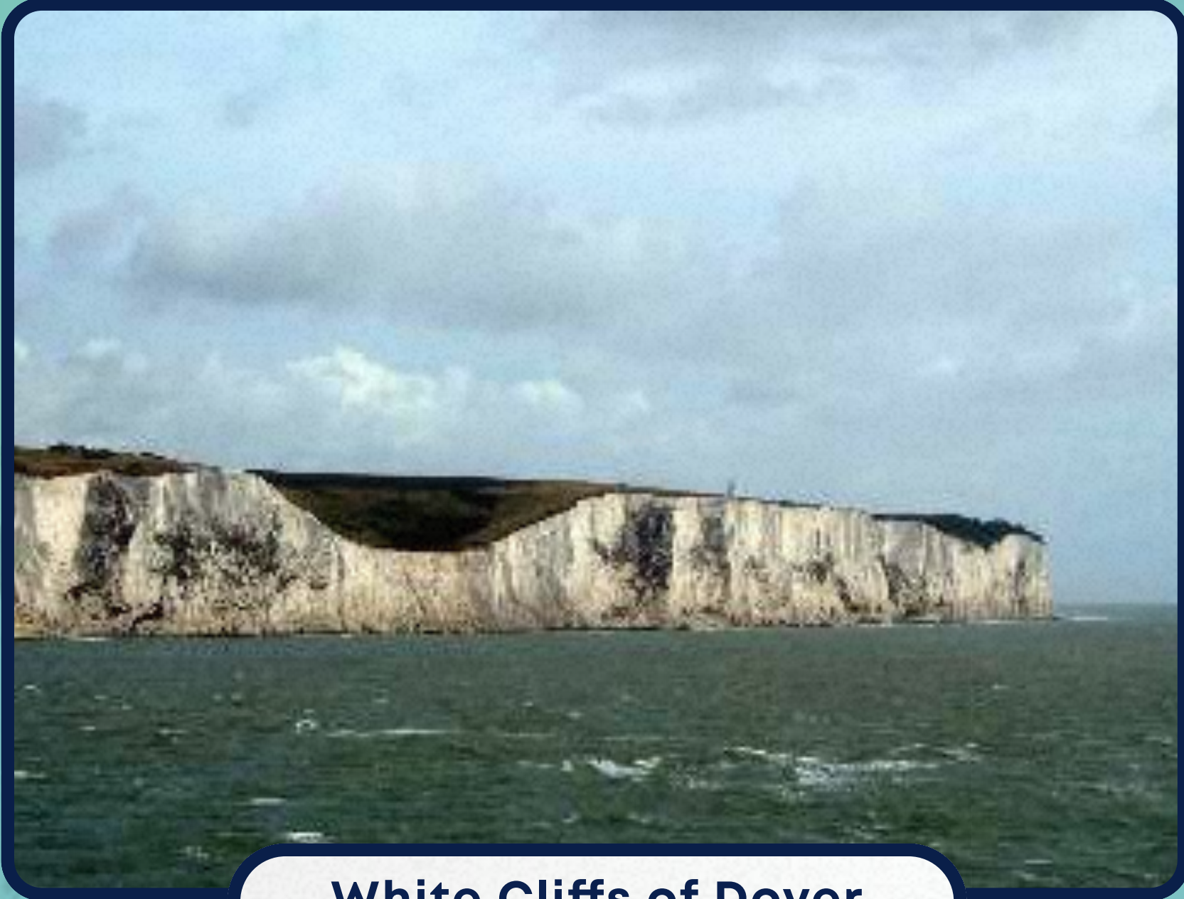
White Cliffs of Dover