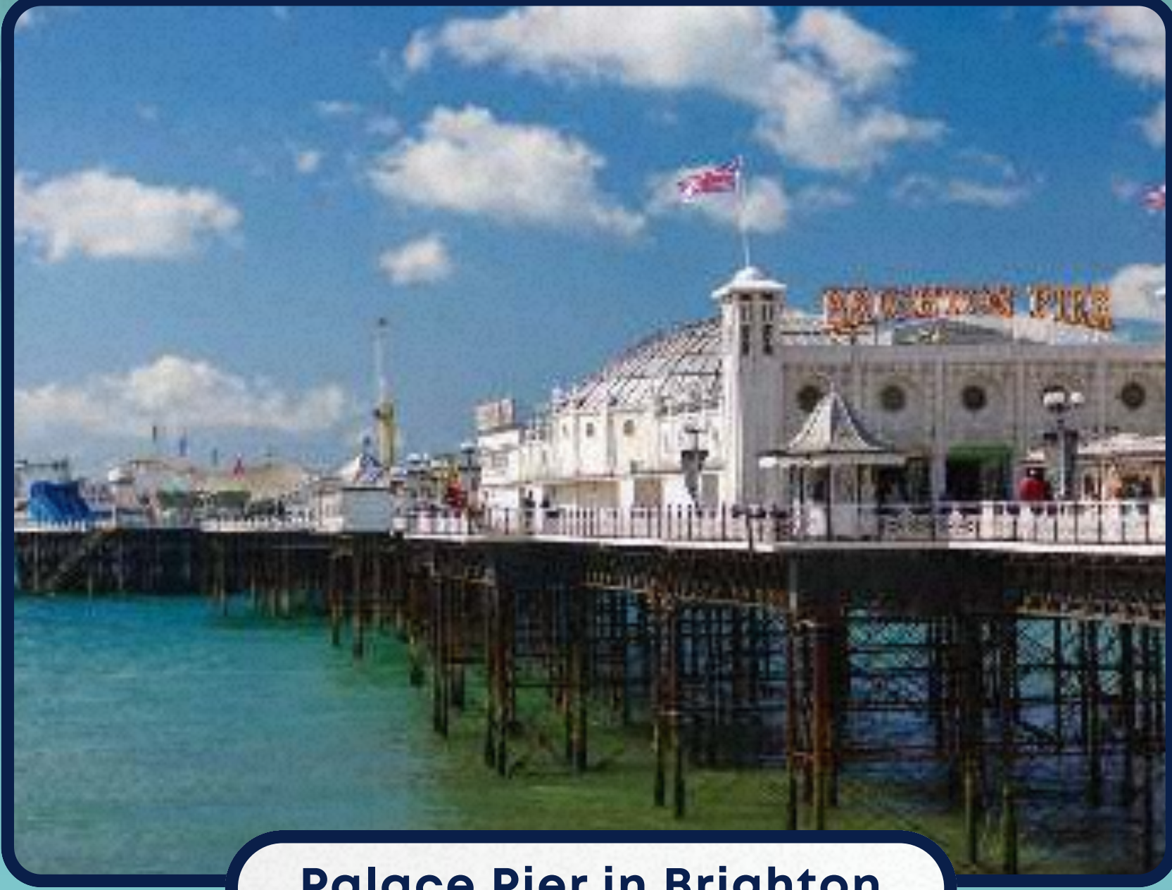
Palace Pier in Brighton