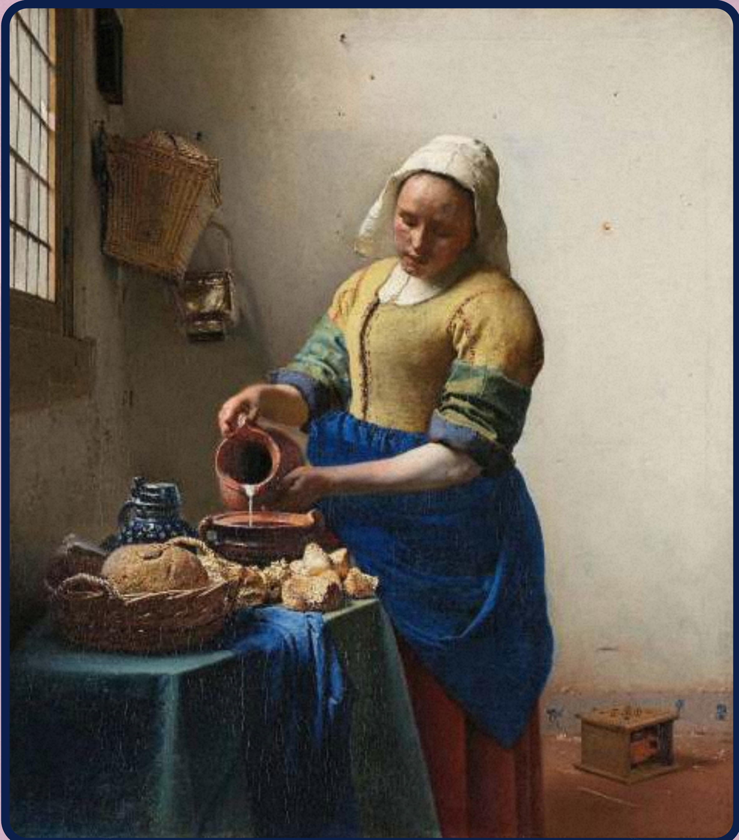
The Milkmaid c. 1658