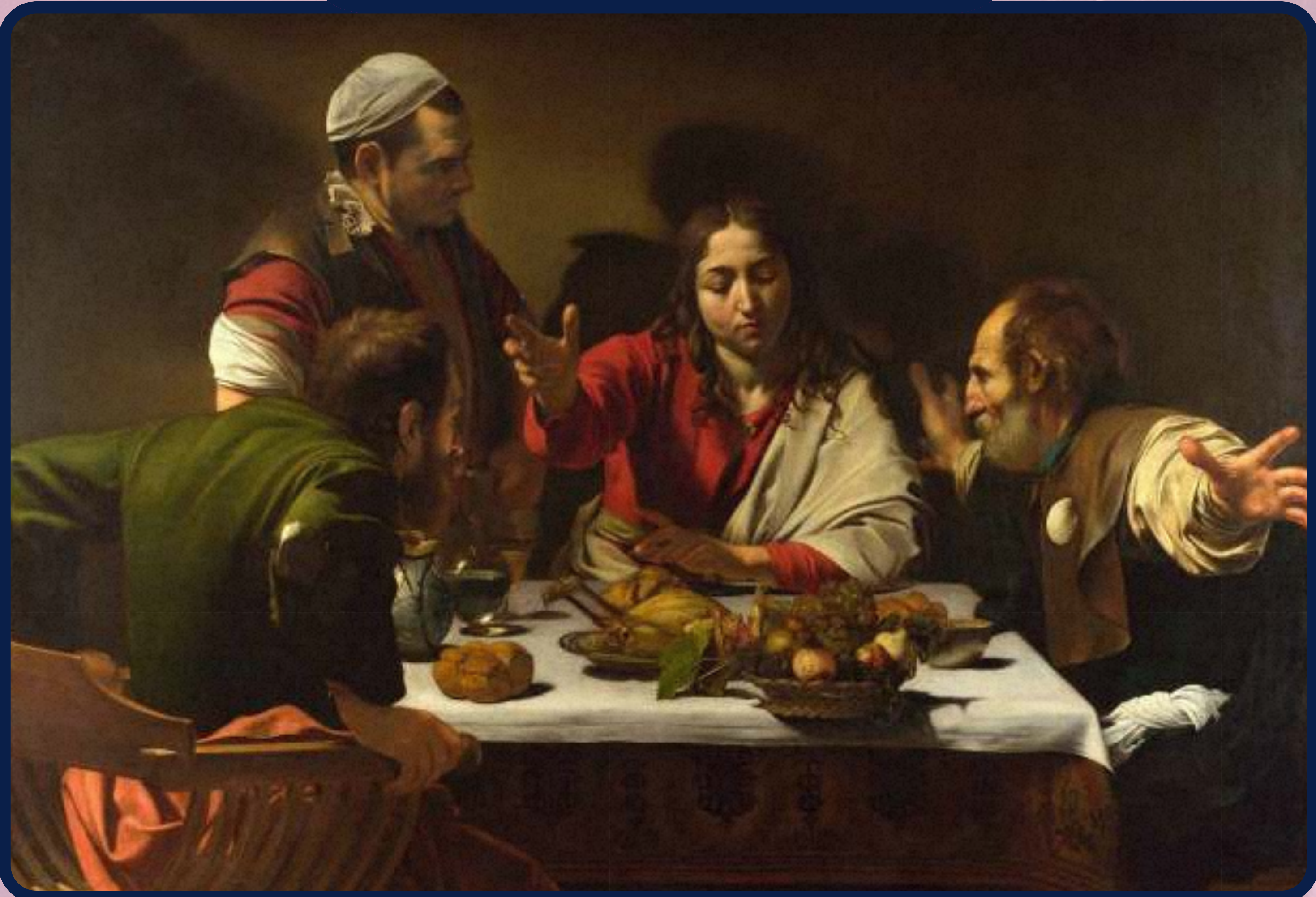
Supper at Emmaus 1601