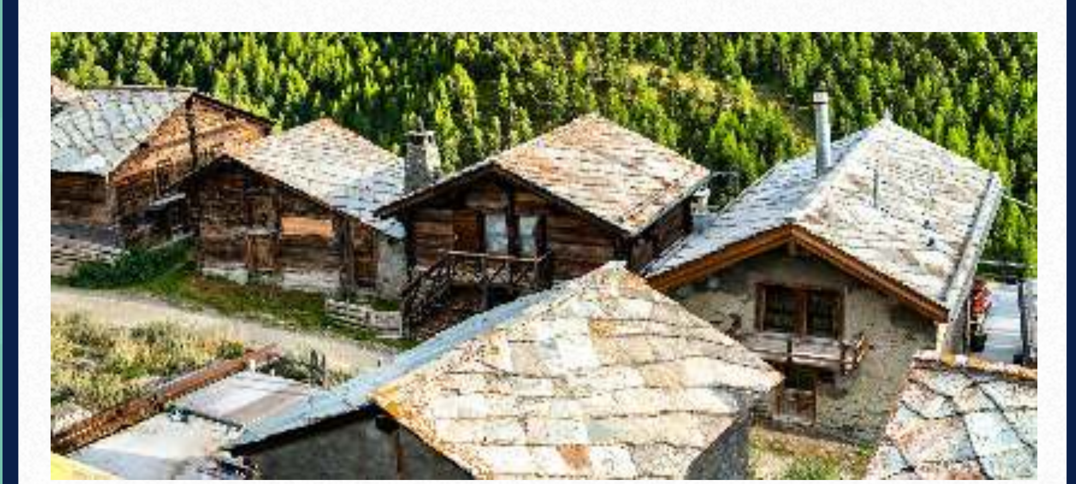
a small settlement with a very small number of homes and no services