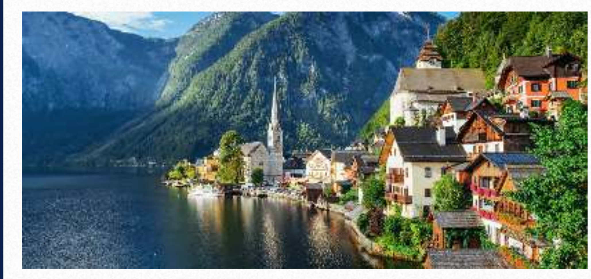
a group of houses in the countryside, sometimes with a church and small shop