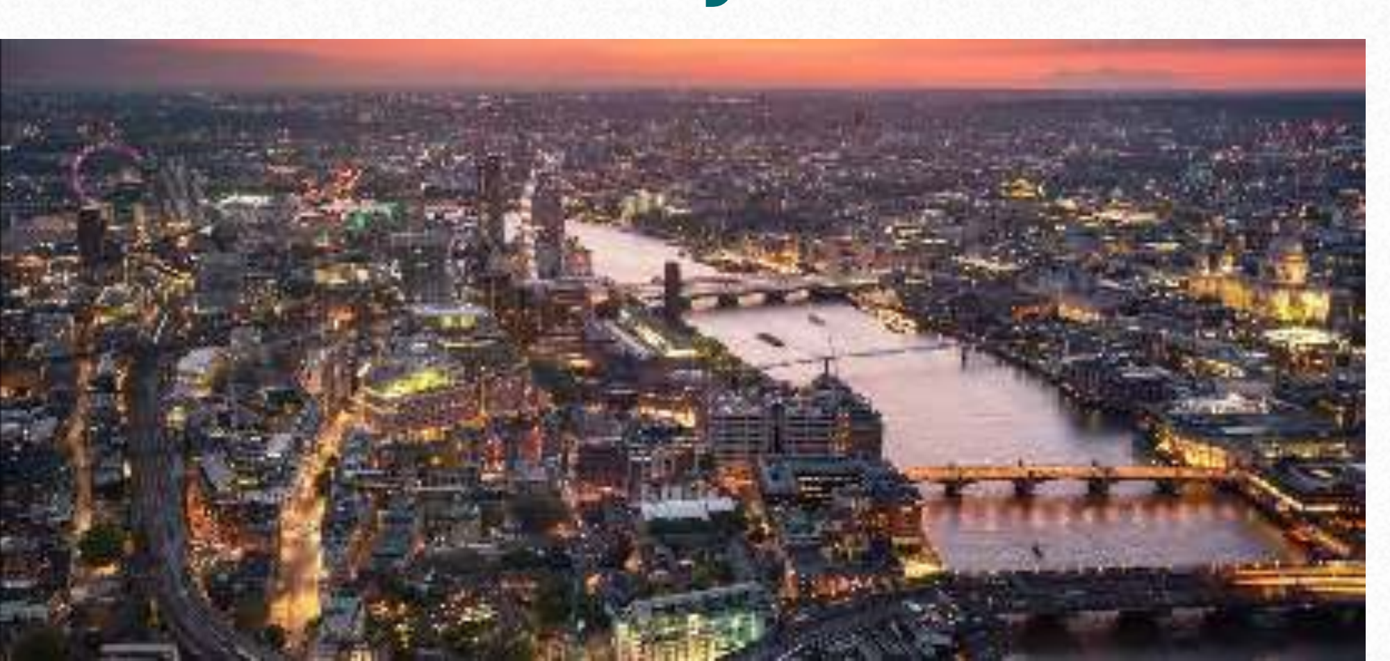
a city is a large urban area where lots of people live close to each other. there are often lots of shops and services in a city