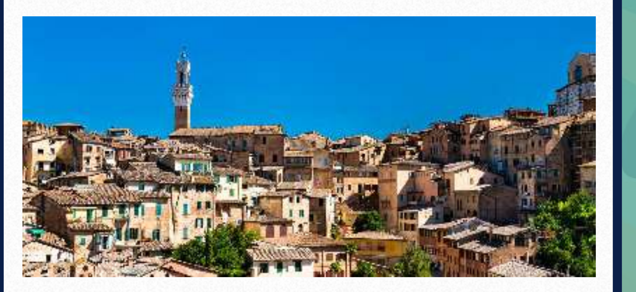
a place where there are lots of houses and shops: a town may have a local council that makes decisions for the people who live there