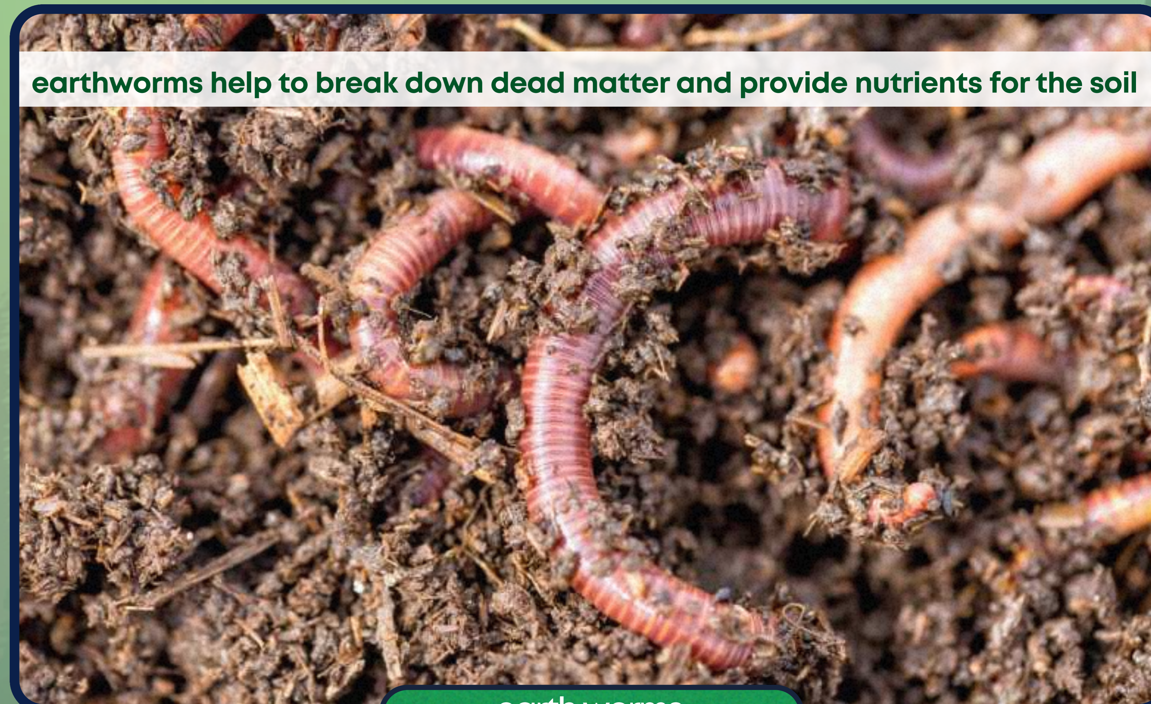
earthworms help to break down dead matter and provide nutrients for the soil