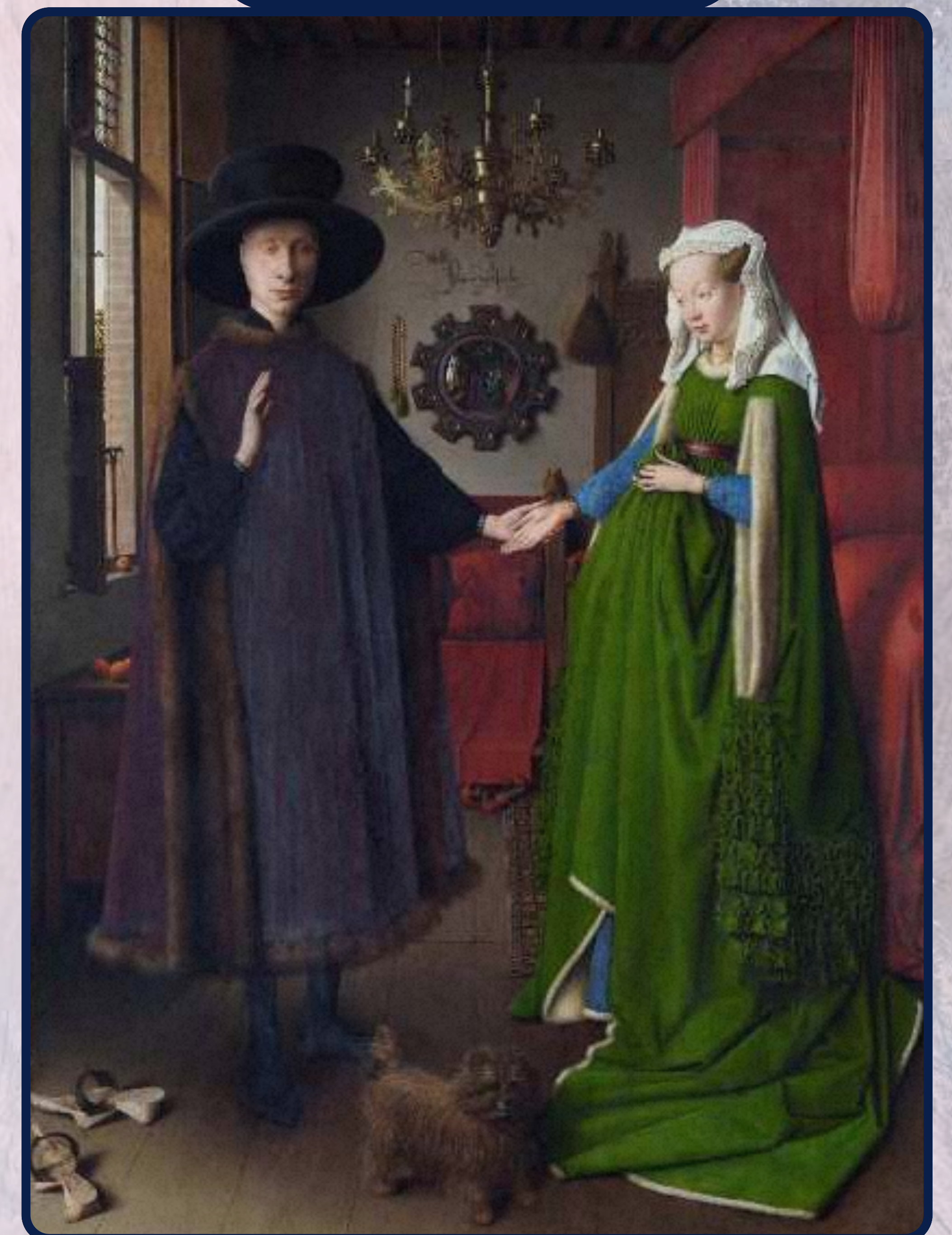
The Arnolfini Portrait (1434)