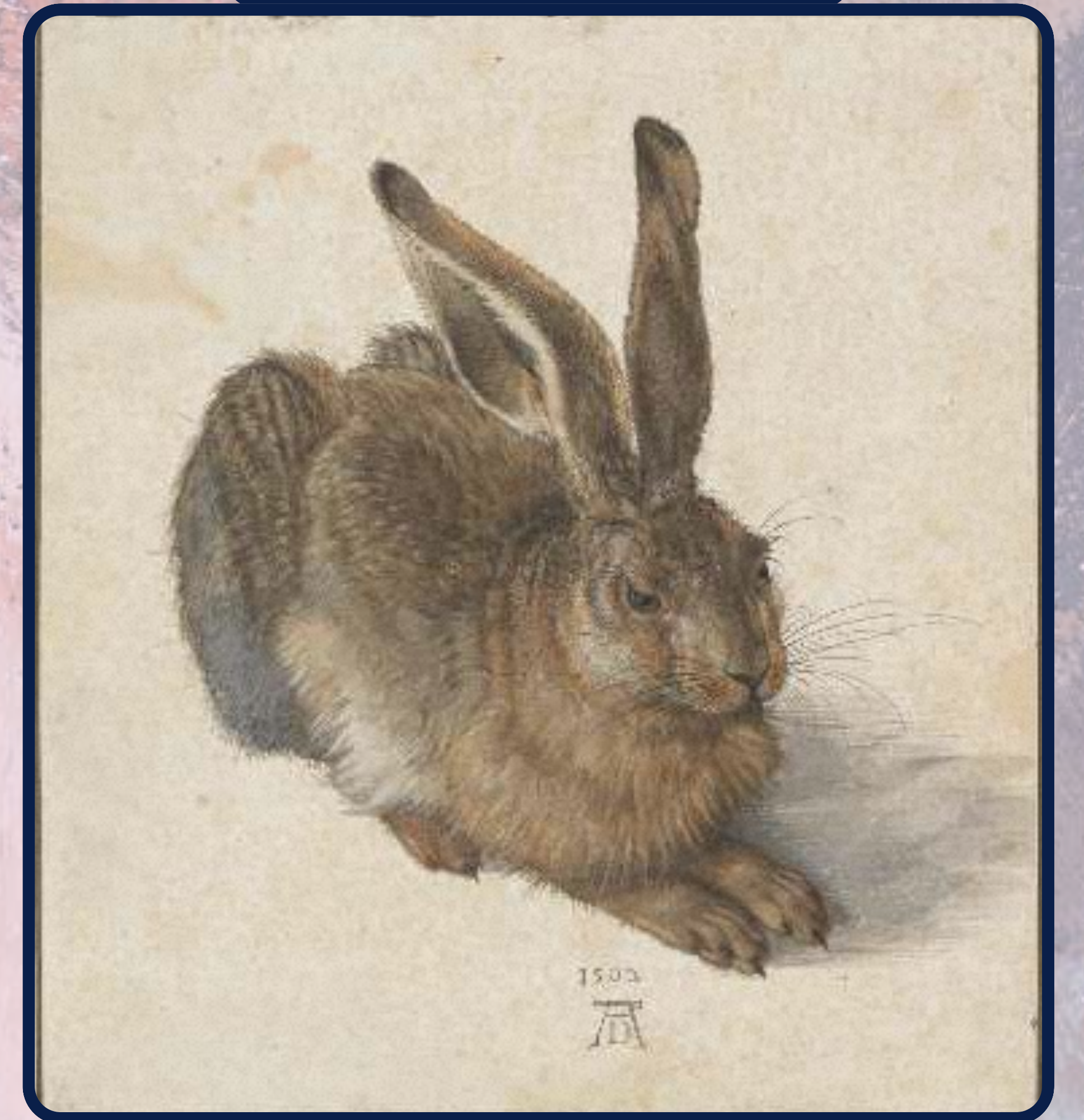
Young Hare (1502)