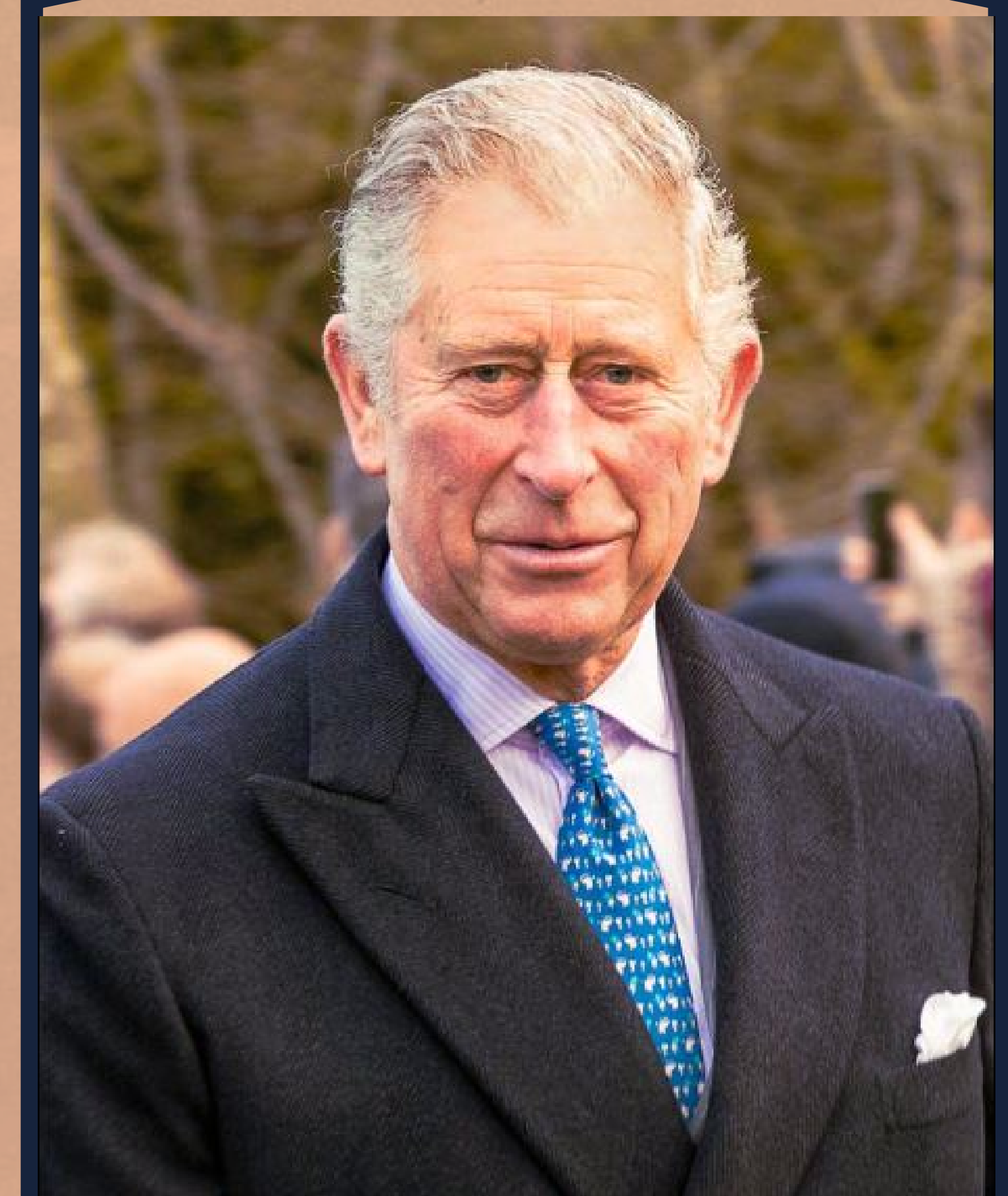
King Charles III