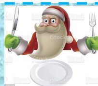
Christmas Dinner 7th December