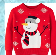
Christmas Jumper 7th December