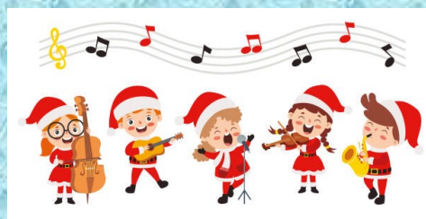
Christmas Concert 14th and 15th December

We aim to provide our children with opportunities to become confident, happy children valuing and respecting diversity and who are proud of their achievements.